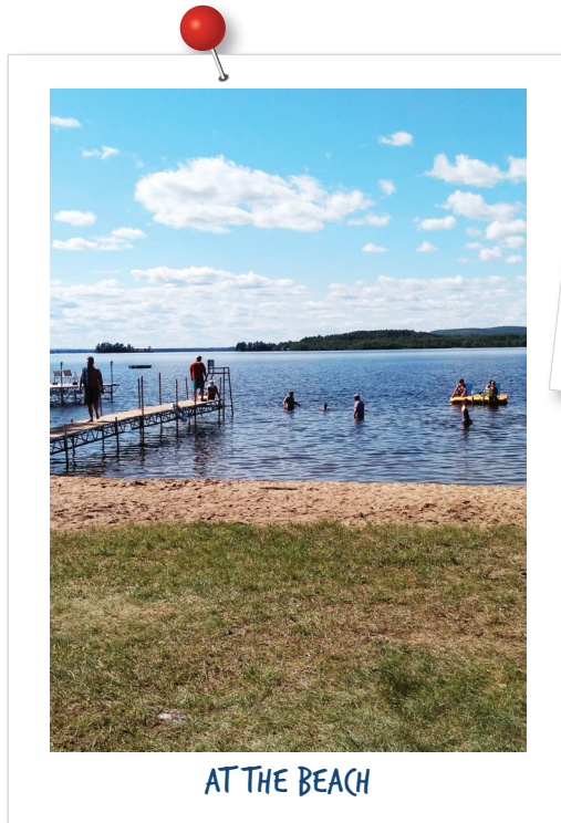
AT THE BEACH